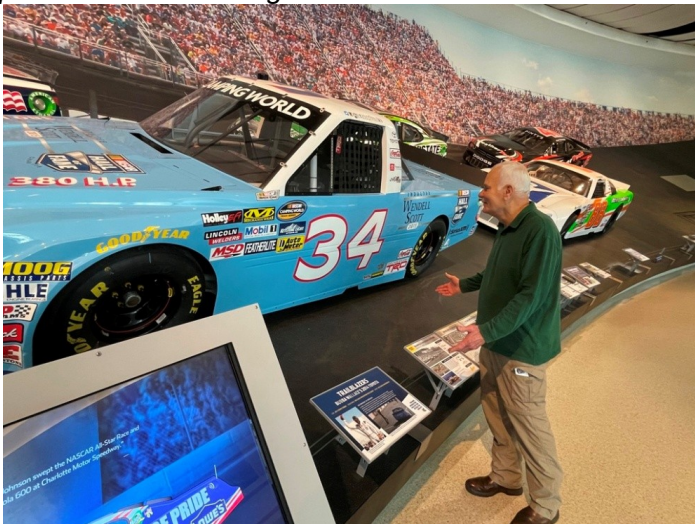
Dozens of historical race cars are lined up in two rows around tapered track.