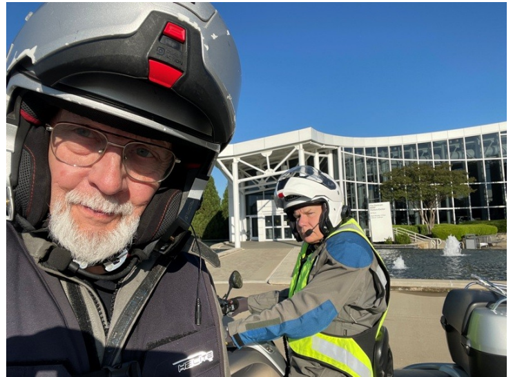
In front of BMW ZENTRUM Visitors Center. We had to arrive ½ hour before tour. Tours were limited to about 2 dozen individuals... then broke up into two smaller groups.

From the distillery, we rode a short distance to Charlotte to stay overnight and go to the NASCAR Museum. For race car enthusiasts, this is a great museum displaying and describing many cars, engines, technologies, drivers & race tracks. We spent a few hours touring the multi-floor building. Joe took the lead to get us out of downtown Charlotte and back to I-85 toward Greenville SC. (My GPS froze as we left the covered car garage and remained that way for an hour until rebooting it.) The leg to Greenville was only 100 miles to the next overnight stop. Our next big tour on Thursday morning was at