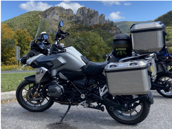
The bike is in Sea Bright, NJ

For Sale: 2015 BMW GS with about 22K miles. Serviced annually at Cross Country BMW. Looking for $10K o.b.o. Call Elio Vecchiarelli at 914 573 9707.