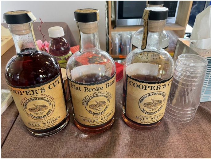
"Sample" bottles of Founding Fathers Distillery's products. All are high-end.