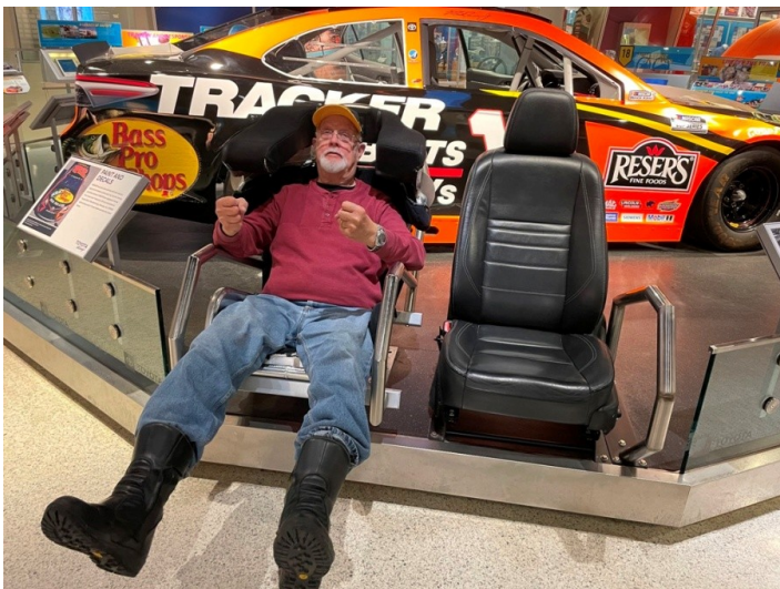
Example of NASCAR racecar seats.... Couldn't easily get out of it.

From the distillery, we rode a short distance to Charlotte to stay overnight and go to the NASCAR Museum. For race car enthusiasts, this is a great museum displaying and describing many cars, engines, technologies, drivers & race tracks. We spent a few hours touring the multi-floor building. Joe took the lead to get us out of downtown Charlotte and back to I-85 toward Greenville SC. (My GPS froze as we left the covered car garage and remained that way for an hour until rebooting it.) The leg to Greenville was only 100 miles to the next overnight stop. Our next big tour on Thursday morning was at